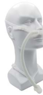
Nasal Cannula (Adult)