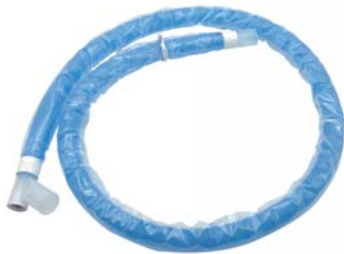
510-049/050 Integrated Heated Breathing Circuit (Built-in Temperature Sensor)