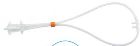
Nasal Cannula (Infant)