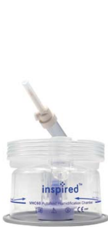
VHC60 Autofeed Humidification Chamber

High Flow Oxygen Therapy is a simple-to-use system that delivers warm, moist gas at high flow rates that generates positive airway pressure. When used at flow rates of 1- 2 L/kg/min it acts as a bridge between Low Flow Oxygen Therapies and Continuous Positive Airways Pressure (CPAP), reducing the need for intubation.